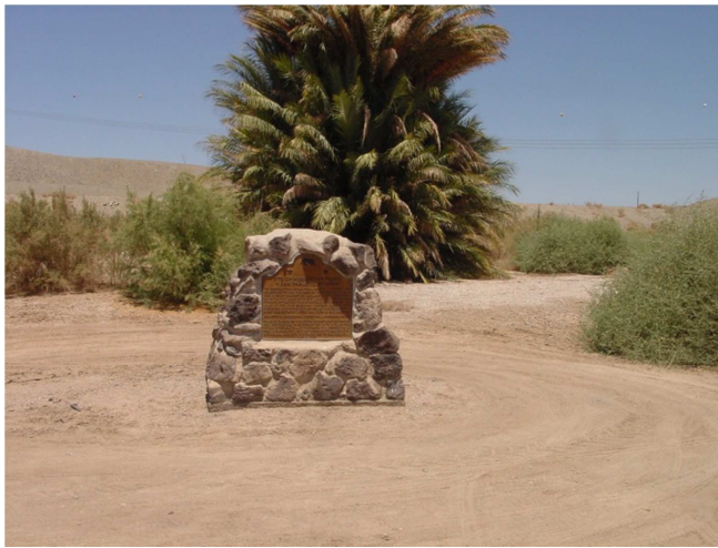
Mission Bicuñer monument

In 1781 a large group of colonists accompanied by 1,000 head of cattle arrived in the area. Although they were destined for the new city of Los Angeles, the Quechan Indians apparently believed their grassland was to be used by the settlers. The Indians attacked both missions in July 1781, killing Captain Don Fernando Rivera, Father Francis Tomás Hermenegildo Garcés, and most other males then present at the two missions. More than 100 Hispanic settlers were killed, and 74 were held captive until ransomed by Pedro Fages in 1782.