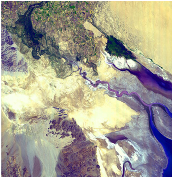
Colorado River delta today

Viceroy Antonio de Mendoza, sent to Mexico to restrain the power of Cortés, launched his own searches. He sent Francisco Vázquez de Coronado to explore the territory in 1540. Mendoza, freed of Cortés' power by the latter's return to Spain that same year, then sent Hernando de Alarcón to cooperate with Coronado's land expeditions. In August 1540, Alarcón's explorers reached the mouth of the river, then towed their boats up the Colorado, which he called El Rio de Buena Guia , or River of Good Guidance.