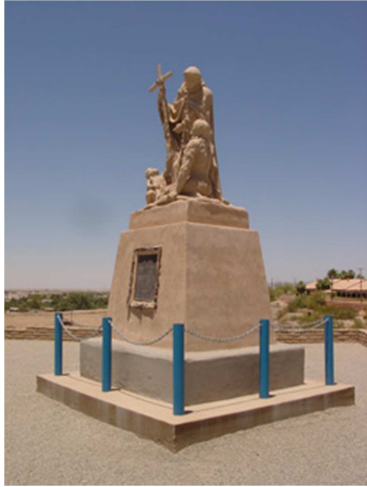
Father Garcés monument in Winterhaven

Purísima Concepción's site is believed to have been on land presently occupied by St. Thomas Church beside the Indian Museum on Winterhaven's Indian Hill. California Historical Landmark No. 350 is located at Winterhaven's Mission St. Thomas near a statute of the legendary Father Garcés, who in addition to accompanying Anza had explored much of California and Arizona, as well the Sonora deserts of Mexico, roaming over the landscape, according to Officer ( Hispanic America 1536-1856 ), even more than the famed Jesuit explorer, Father Eusebio Francisco Kino.